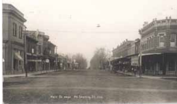
Main Street, Mt. Sterling (2011)