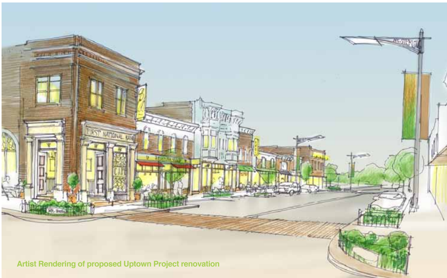
Artist Rendering of proposed Uptown Project renovation