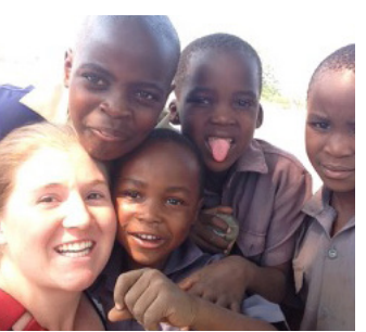
3G Family Member Volunteering at a Nonprofit Organization